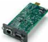
Liebert® Intellislot® Communication Card